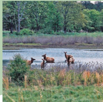
Amidst the rolling Cookson Hills in the Ozark region of eastern Oklahoma, the 14,000-acre J.T. Nickel Family Nature and Wildlife Preserve protects six watersheds, which flow into the nearby Illinois River, and a newly re-introduced herd of elk.