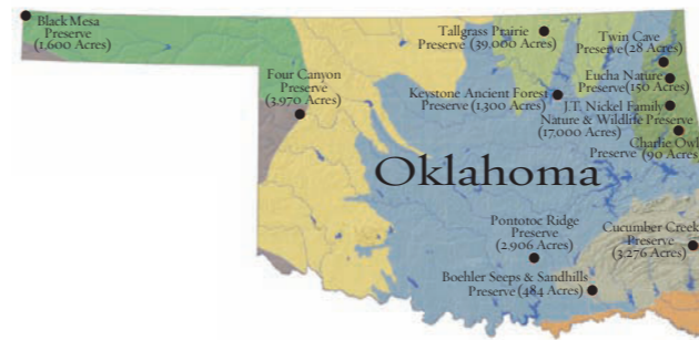
70,000 Acres - 11 Preserves - 8 Ecoregions - 1 State