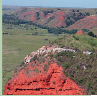
The Four Canyon Preserve in western Oklahoma encompasses 4,000 acres of mixed-grass prairie, rugged canyons and flood plain along the Canadian River.